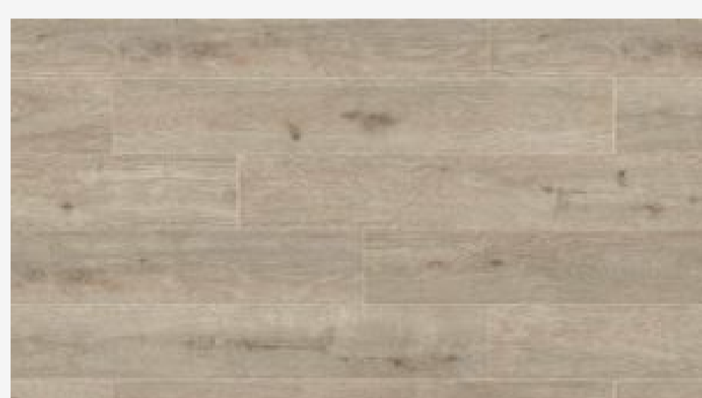
Silver Shadow Oak